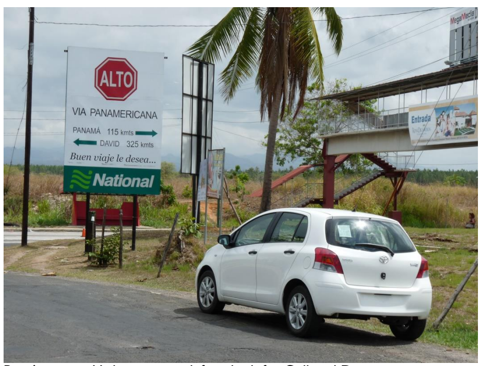
Pan American Highway – turn left to look for Collared Doves

150 km along the northern coast from Cancun on the Yucatan peninsula. It is a sleepy village with a resident bird guide so we went out birding in the mornings and stooged around in the hire car in the afternoon when it got too hot. One day we finished up in a nearby coastal village for which fly blown would be a fair description – it was the sort of place where Clint Eastwood chewed on cigars in the Spaghetti Westerns. I looked out of the car window and there, amidst the tumbleweed and drifting sand, were a pair of Eurasian Collared Doves disconsolately pecking at the Mexican earth. I was a bit surprised but maybe one shouldn't be with Collared Doves.