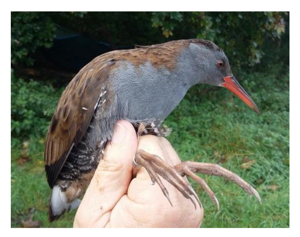
Figure 1: Water Rail trapped in Ladywell on 26th October 2016. (Mark Mallalieu).

On each visit, including some short visits for stocking feeders or maintenance work, a list of species recorded is logged onto the British Trust for Ornithology's Birdtrack recording system. On most ringing occasions between 30 and 45 species were recorded; a total of 79 species were seen during the year and these are listed, along with the first and last dates and the percentage of occasions seen in the appendix below. Only Woodpigeon, Jackdaw, Carrion Crow and Blackbird were recorded on each visit.