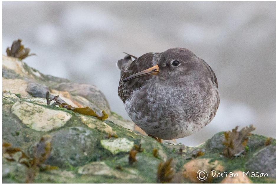
There were four Purple Sandpipers at Shoreham Harbour on 29th.

High counts at Goring Gap included 11 Mediterranean Gulls on 12th, 63 Sanderling on 1st, 70 Grey Plover on 15th, 330 Dunlin on 15th and 91 Ringed Plover on 1st. 45 Great Crested Grebes, around 30 Red-breasted Mergansers, 20 Red-throated Divers and a Long-tailed Duck were offshore from Worthing/Ferring on 8th. Four Gadwall were at Brooklands on 20th and a Hen Harrier was at Steep Down on 21st.