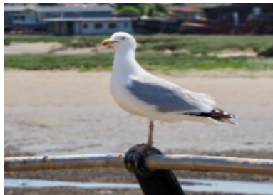
Herring Gull Always present at the reserve; eats fish and almost everything else, often seen in large flocks.

Many birds can be found on the RSPB Nature Reserve in Shoreham by Sea. Here are some of the more common birds that can be seen. To find out more about birdwatching locally please visit the Shoreham District Ornithological Society or the RSPB Brighton and District Local Group websites detailed below.