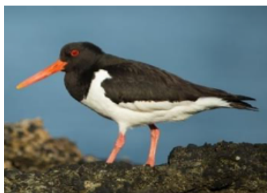
Oystercatcher More noticeable during winter; it uses the long beak to prize open shellfish but also eats worms and shrimps.