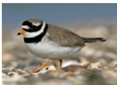
Ringed Plover This seasonal visitor is found between August and April; it often feeds in small groups on the mudflats and shell-banks.