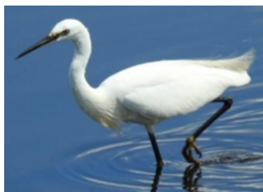
Little Egret Always present, with numbers increasing during winter; eats smaller fish and is often seen at the shallow water edges.