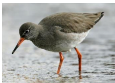
Redshank Usually found at the reserve between July and April; it uses the long beak to probe the mud to find worms to eat.