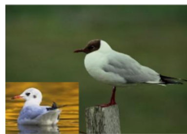
Black-headed Gull Less commonly sighted in the summer; has red legs and bill, black head is absent in winter.