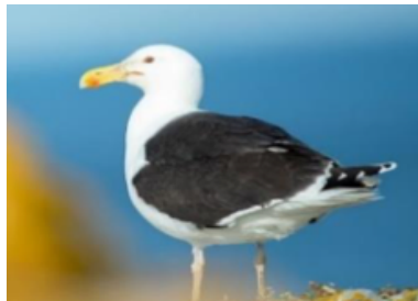
Great Black-backed Gull Regularly seen on the river; a brutal scavenger, identified by its huge size and black back.